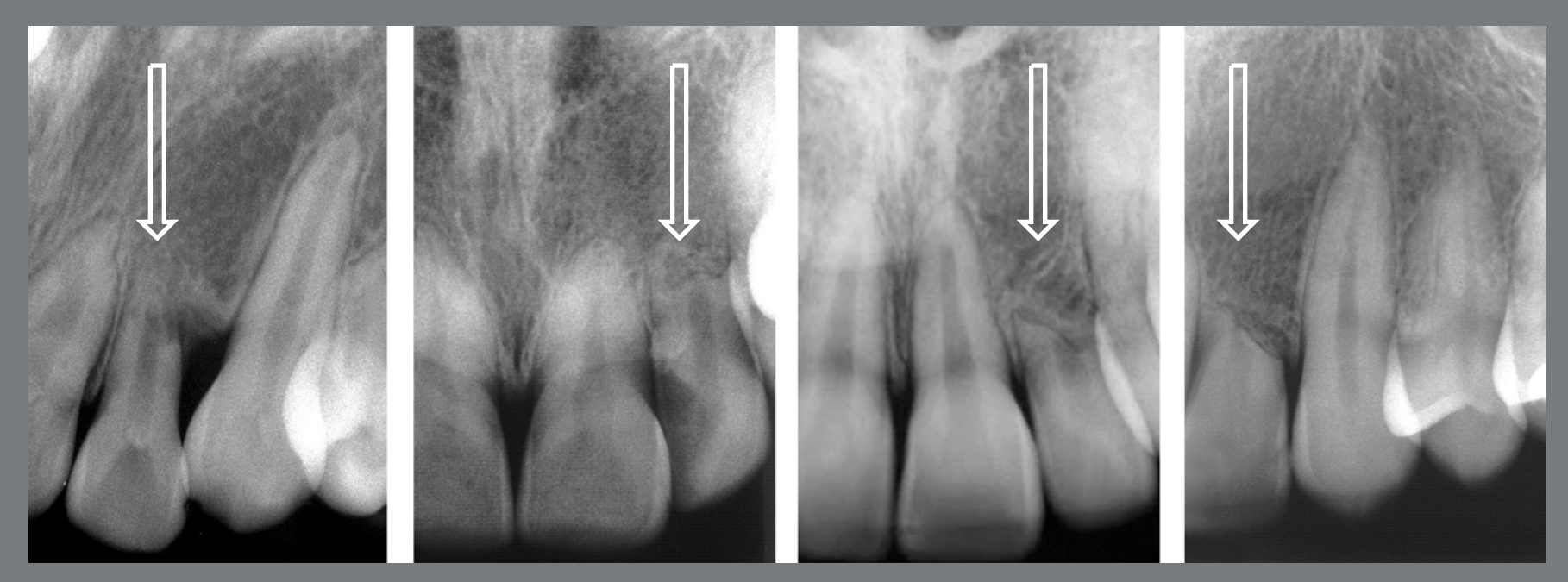
Figure 1: Four maxillary lateral incisors that have served as laterality guide for a period longer than 1 year, which would naturally and properly occur as function of the maxillary canines. The masticatory and occlusal overload induced establishment of the occlusal trauma lesion in its most advanced form, and it is characterized by inflammatory root resorption in plane (arrows). Pulp vitality is preserved.

In this situation described above, our experience with several cases has almost always led us to indicate this resorption as being part of the lesion or disease called "occlusal trauma", with late manifestation of months and years of progression and preceded by other manifestations, which we will discuss next. Since the beginning of this "occlusal trauma" lesion, it has been caused by the chewing overload determined on the maxillary lateral incisors in this situation, when these teeth have been used as a guide for the movement of laterality, and not the canines (Figs 1 and 2).