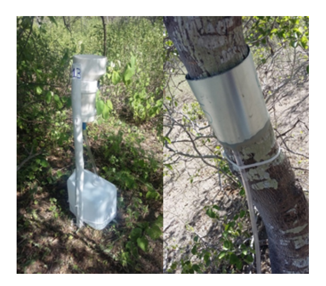
Figure 2. Measurement of throughfall (left) and stemflow (right) in plant species of the Caatinga domain in municipality of Floresta, State of Pernambuco. Brazil.

The volume was converted to SF by dividing it by the canopy projection area (Zabret et al., 2018). Interception loss (in mm) is expressed as the GR that does not reach the soil and is retained in the canopy (Equation 3) (Zhang et al., 2015, 2016):