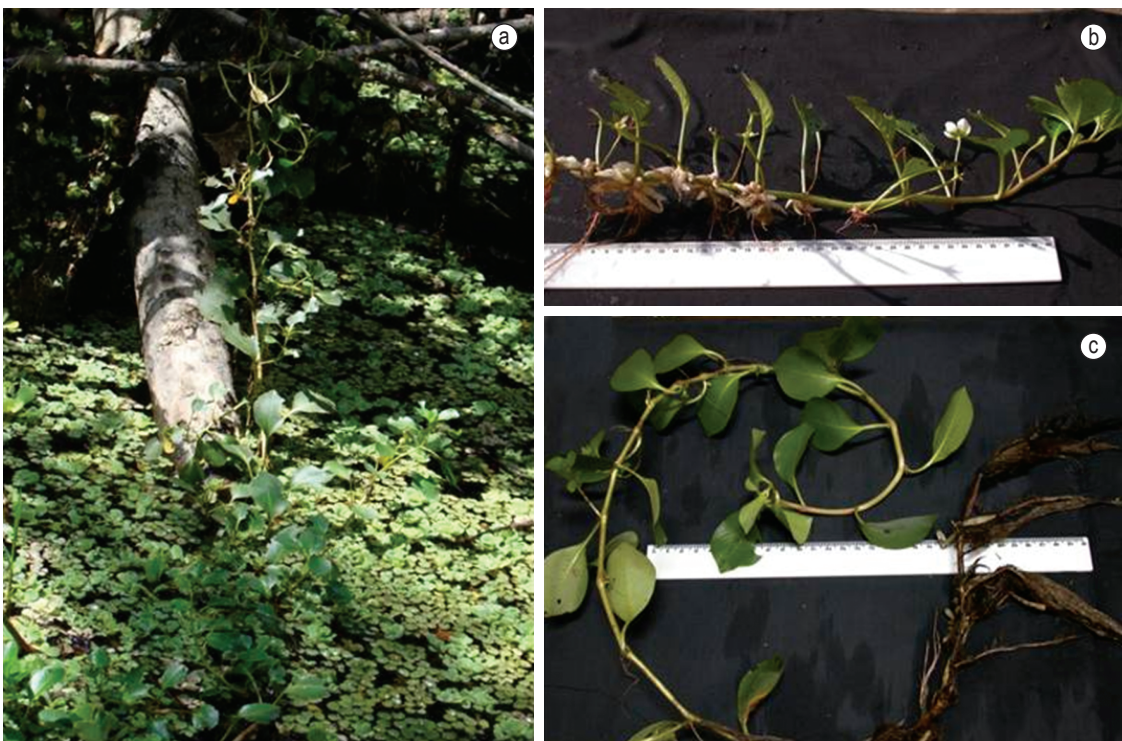
Figure 1. Morphological plasticity in Ludwigia helminthorrhiza (Onagraceae). a) plant's general aspect; b) roots with aerenchyma during the aquatic phase; and c) roots without aerenchyma during the terrestrial phase (Photos: S.A. D'Angelo).

To analyze a group of plants as diverse the peculiarities of the environment on a larger scale should be take into account. The assumed uniformity of the vegetation in the Amazon region in fact hide variations detectable by means of analyses of latitudinal gradients, from the most central part of the basin towards its borders. In the Occidental border the Amazonian physiognomy leaves the Brazilian territory and meets the pre-Andean and Andean region. Two eroded shields constitute the North and South limits, the Guyana's and Brazilian's shields, respectively. Thus, an analysis of the hydrological situation and its relation to the geomorphologic variables is necessary to understand the occurrence and diversity of the herbaceous aquatic plants in the region.