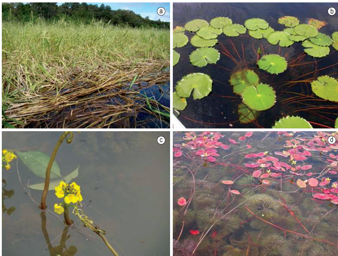
Figure 4. Common species found at the igapós of rio Negro: a) Oryza perennis (Poaceae); b) Nymphaea rudgeana (Nymphaeaceae); c) Utricularia foliosa (Lentibulareaceae); and d) Cabomba aquatica (Cabombaceae).

natural and human disturbance of habitats, which reduces competition with native species.