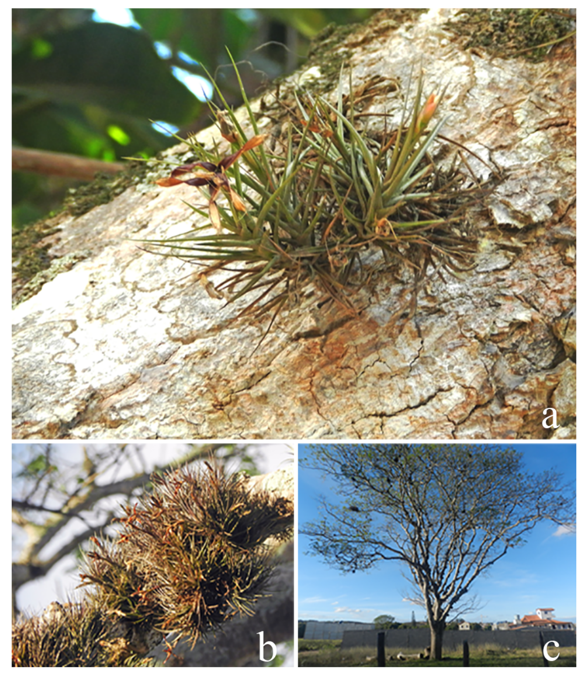
Figure 2. Tillandsia candida Leme. a. Habit. b. Habit. c. Phorophyte.