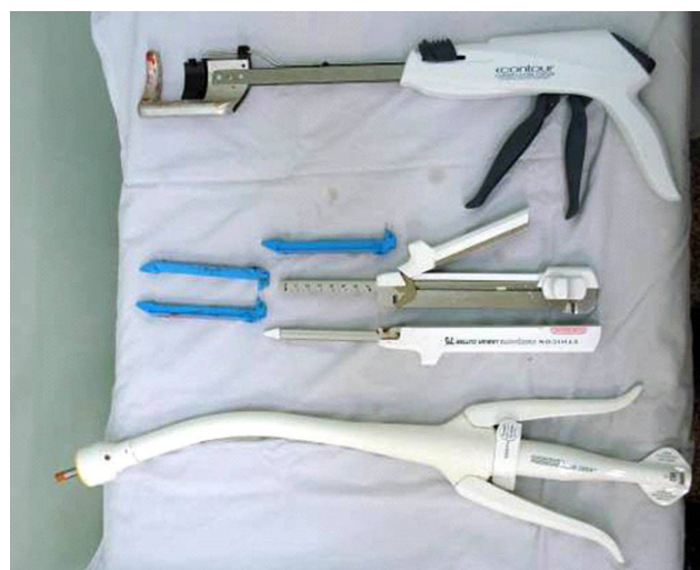
Figure 1. Linear, circular and curved cutter staplers.

Average hospital stay was 10 days (5 to 57 days): 10.1 FAP and 10.7 UC. Fifty percent of patients with UC had surgical complications in the early postopera-