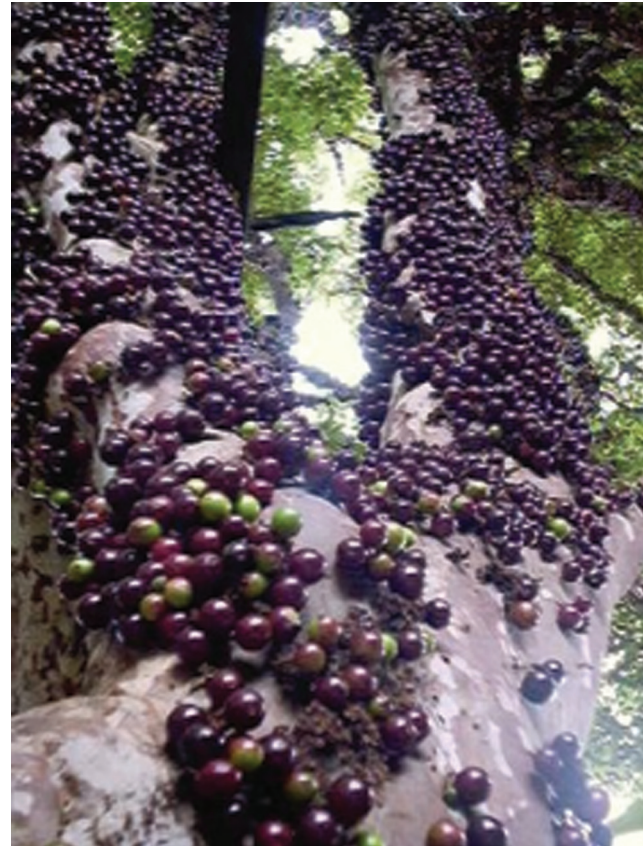
Figura 1. Jaboticaba tree.

After multiple enemas, laxatives and successive attempts of manual removal of nodules, the patient evacuated a large amount, eliminating the seeds and improving from her initial condition in four days. Today, the patient is normal, without recurrent obstruction.