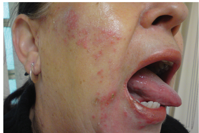
Fig. 3 – Facial cutaneous reaction an IFX-treated patient.