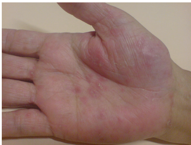
Fig. 4 – Hand cutaneous reaction during IFX treatment.