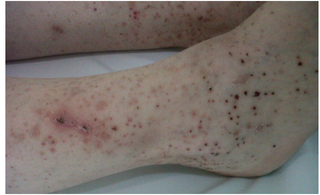
Fig. 1 – Leukocytoclastic vasculitis after 3 years of ADA treatment.

The two groups of patients included in this study were considered to be homogeneous. The median age of patients receiving IFX was 41.3 years, this being similar to that found in the literature in two studies with large patient samples, in which the median ages were 35 and 37 years. 8,13 With regard to the demographic profile of the patients treated with ADA,