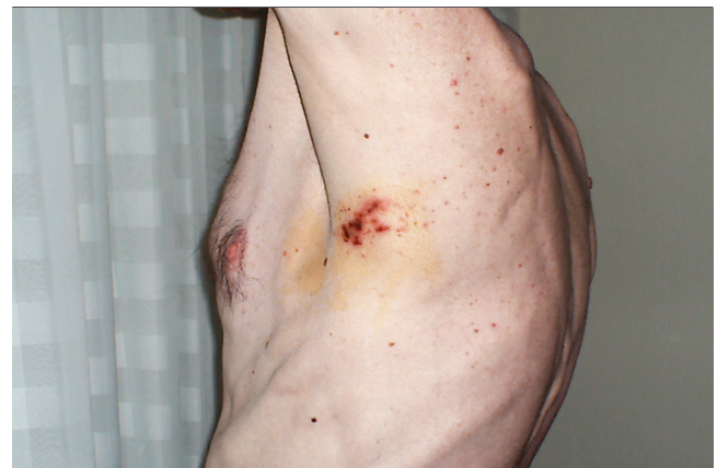
Fig. 2 – Herpes zoster infection during ADA treatment in a patient with severe CD and short bowel syndrome.