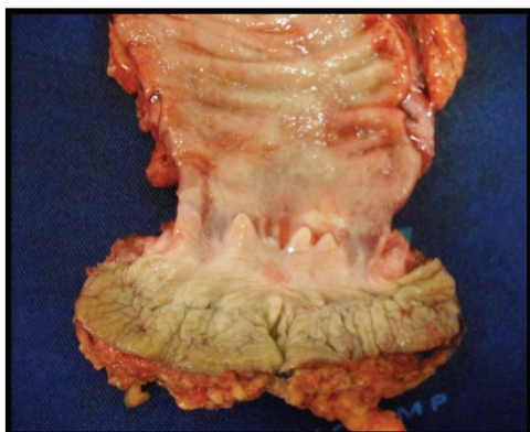
Fig. 1 - Sample of rectal amputation after neoadjuvant therapy with no residual malignancy.

The anatomopathological analysis of the surgical specimen showed that 2 (6.7%) patients had lymphatic invasion, and 1 (3.4%) of them also had 5 affected lymph nodes. Other 2 patients also had lymph node involvement, respectively, with