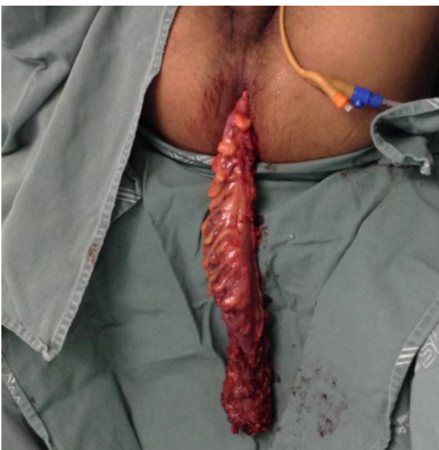
Fig. 2 – Removal of the surgical specimen.

The TATA resection technique was first described by Marks, as an alternative to abdominoperineal resection with permanent colostomy in patients with low rectal cancer. In 2010, Marks described his experience with TATA laparoscopically, reporting a case series of 79 patients with no perioperative mortality