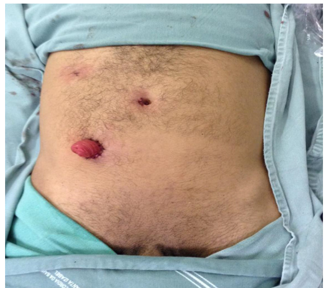
Fig. 4 – Final appearance.

In 2013, McLemore held TAEP using minimally invasive transanal surgery (TAMIS) in a series of 5 human corpses (all male), with a surgical time of 200 (128-249) min. In the perianal time, this author used GelPOINT-Path; in the abdominal