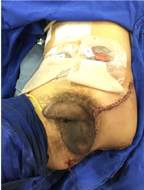
Fig. 3 – Final aspect after reconstruction with lateral thigh flap.