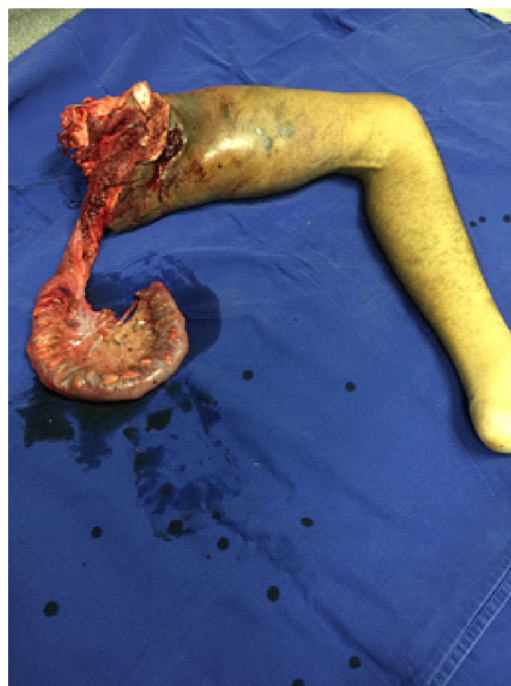
Fig. 2 – Surgical piece in monobloc.

The patient is being followed up in an outpatient setting, with no signs of tumor recurrence.