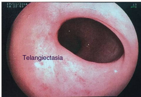
Fig. 3 – Endoscopic aspect of a patient with complete clinical response.

thus greater local and distance control, as well as better PFS and OS. 8 Considering this data, the real need for surgery in this group was questioned; Dr. Angelita Habr-Gama, from Brazil, was the first to conduct a study in order to elucidate this question and to experimentally adopt the wait-and-see policy (no surgical resection and vigilant follow-up).