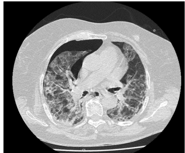
Fig. 1 – Computed tomography image showing alveolar interstitial infiltrate and right pneumothorax.

On physical examination, she had tachypnea, 91% oxygen saturation in ambient air, fever and pulmonary auscultation disclosed decreased breath sounds on the right with