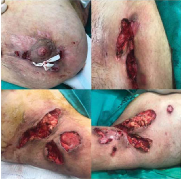
Fig. 2 Intraoperatory – breast, suprapubic, left armpit, right armpit.