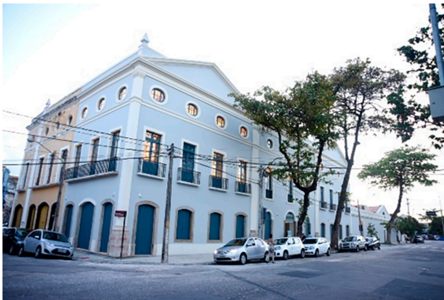
Figure 3. The Apolo 235 building, opened in 2017