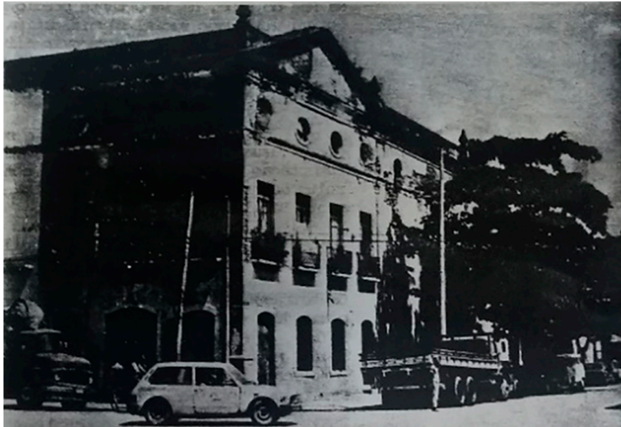
Figure 2. Pensão Convento in the 1980s

a “real estate agent” or a “large real estate” (interviews held on October 16 and 25, 2017, with a resident of Bairro do Recife, and on October 21 and 30, 2017, with a City Hall technician). This last interviewee stated that: “I joke a lot with the people from Porto Digital, which is no longer Porto Digital, it’s the Digital Monopoly . Because they’re buying everything, spreading out ... they’re already in Santo Amaro”.