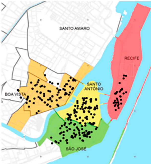
Figure 5. Locations of sold real estate (ITBI) 4 between 2008 e 2013