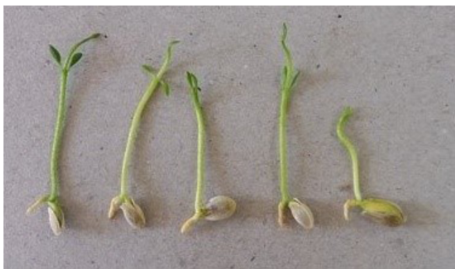
Figure 2. Abnormal seedlings of Rangpur lime: root thickening and shortening. IAPAR, Londrina, PR.

A significant difference was observed between lots within each temperature. Lots 2, 4, and 5 showed a percentage of germination similar and higher than 80% when the test was conducted at 25 and 30 °C. However, a significant difference was observed in relation to lots 1 and 3, which did not differ from each other and presented germination below 80% (Table 1).