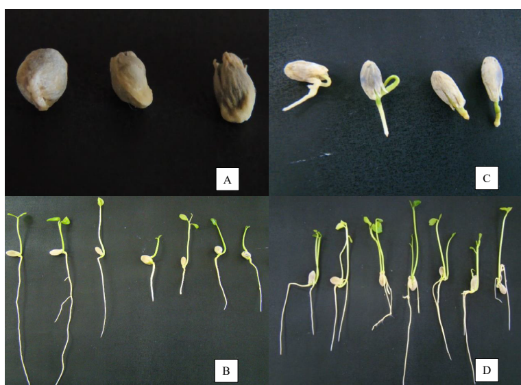
Figure 1. Seedlings and seeds of Rangpur lime observed in the germination test evaluation: dead seeds [A], normal seedlings [B], abnormal seedlings [C], and polyembryonic seedlings [D]. IAPAR, Londrina, PR.

The data of germination test, time required to reach 50% of germination, and parameters a , b , and c , obtained by the Weibull distribution model, were submitted to analysis of variance by the F-test with p < 0.05 , considering the treatments arranged in a 5 (lots) \times 3 (temperatures of 25, 30 and 35 °C) factorial scheme with four replications of 50 seeds in a completely randomized design, totaling a population of 200 seeds for each treatment. The necessary slicing was carried out in the presence of significant interaction since the marginal means of both lots and temperatures do not represent what actually occurred at each situation generated