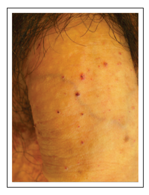
Figure 3. Few lesions over the penis of a severely affected patient.