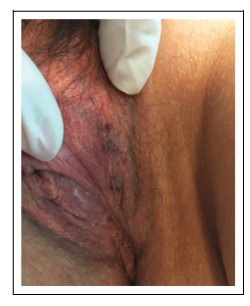
Figure 6. Multiple vulvar lesions.