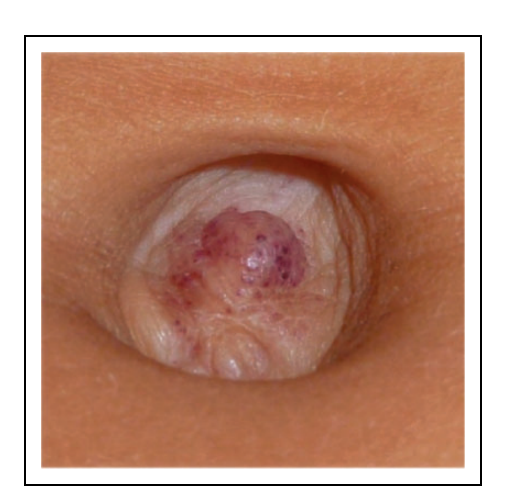
Figure 8. Umbilical papules.