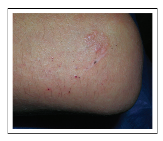
Figure 5. Lesions over the elbow (Köebner phenomenon).