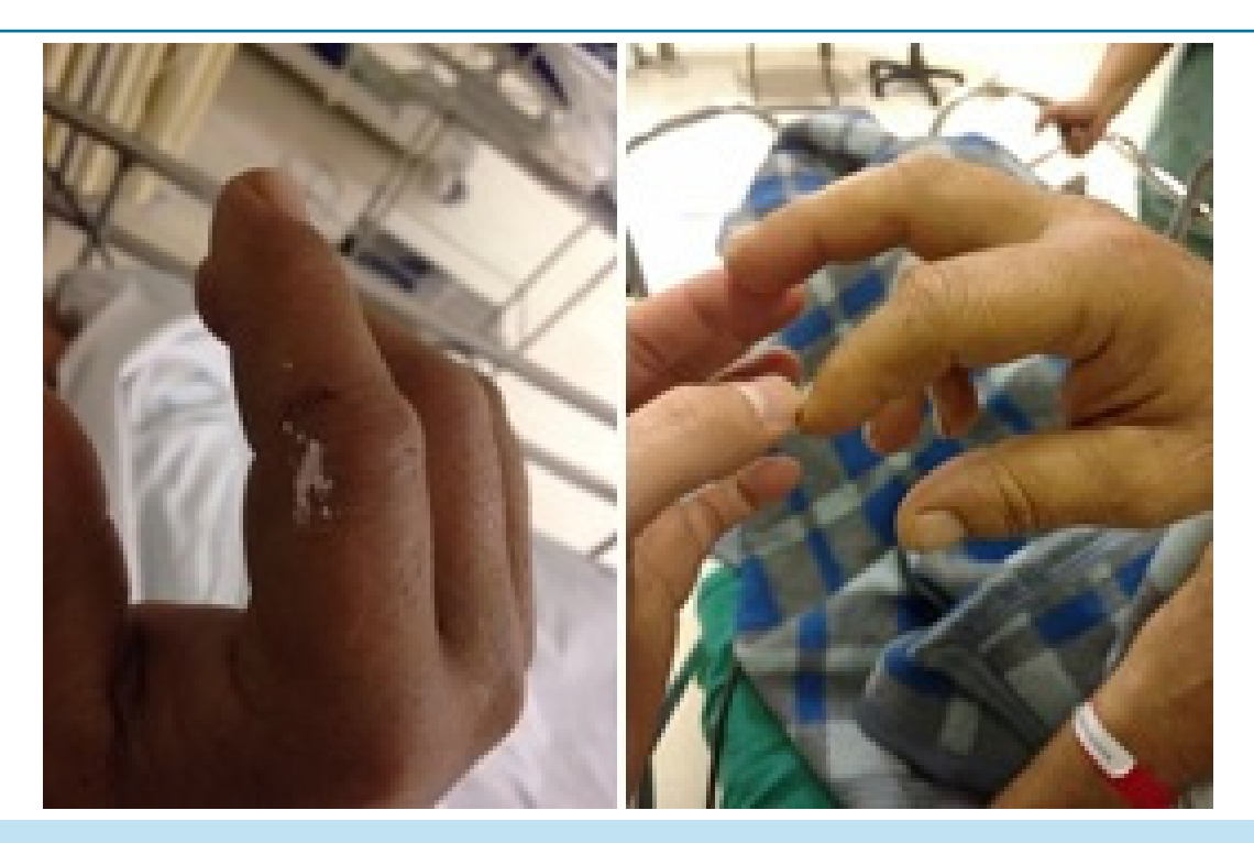
Figure 1 – Snake bite marks in the index finger of the right hand.