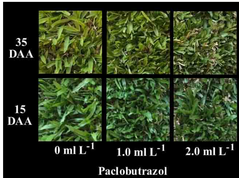
Figure 1. Visual aspect of Carpet grass Plus® after application of Paclobutrazol. DAA- Days after application.

In relation to phenoxaprope-p-ethyl, only for green component (G) there was mean decreased from 15 to 35 DAA for dose 2.0 ml L -1 , differing from what happened with paclobutrazol, which maintained the indexes at 35 DAA, even after the cut (Table 3). However, with 6.25 µL L -1 had a moderate reduction of fresh mass at 15 and 35 DAA (Table 1), maintaining LCI values (Table 2) and green (Table 3), and thus, the aesthetics of the lawn (Figure 2).