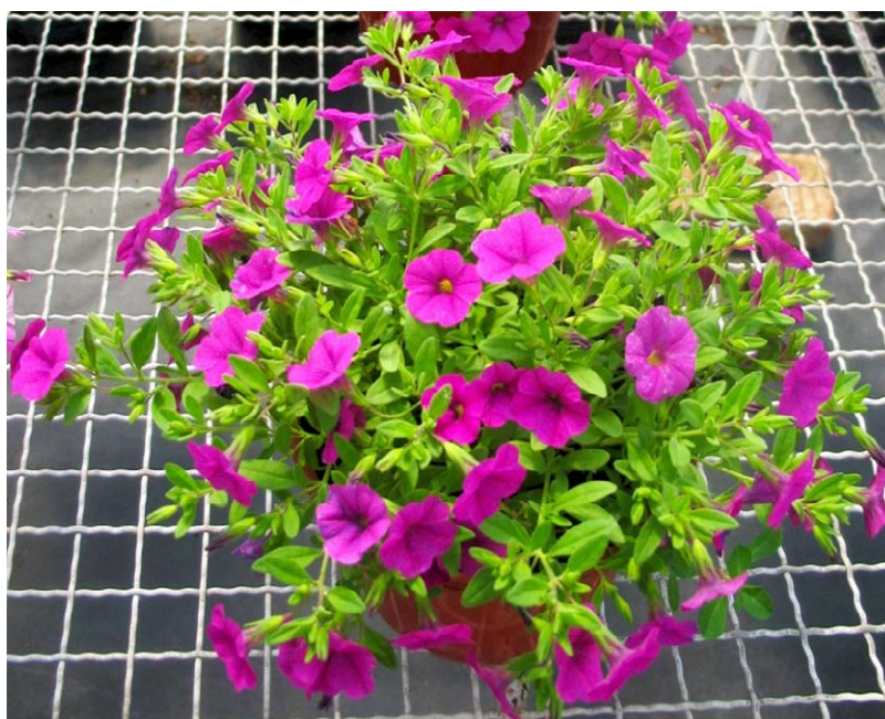
Figure 1. Healthy potted plant of Calibrachoa hybrida INTA 06575 on a greenhouse bench.

In October 2019, plants of calibrachoa INTA 06575 (Figure 1) grown in a polyethylene greenhouse in Hurlingham (Buenos Aires) developed a leaf spot disease.