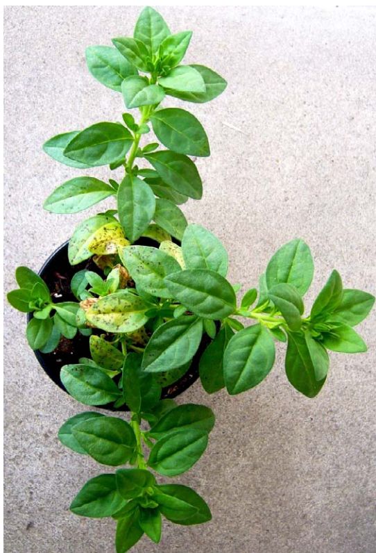
Figure 2. Spots caused by Nigrospora oryzae on basal leaves of Calibrachoa hybrida INTA 06575.

The fungal colonies developed from the leaves were subcultured onto fresh PDA at 25 °C to obtain a pure isolate, and study its characteristics. To enhance sporulation, 5 mm diameter plugs from the margin of an actively growing culture were transferred to the centre of Petri dishes containing synthetic nutrient-poor agar medium (SNA) and incubated at 28 °C (Wang et al., 2017). Additionally, in order to better clarify the identity of the pathogen, a molecular characterization of the purified isolate was performed amplifying and sequencing part of the ITS rDNA region using primers ITS1 and ITS4 (Wang et al., 2017). The sequence obtained in this study was submitted to GenBank (accession number MT177215) and the nucleotide BLAST comparison with published sequences at NCBI ( http://www.ncbi.nlm.nih.gov/ ).