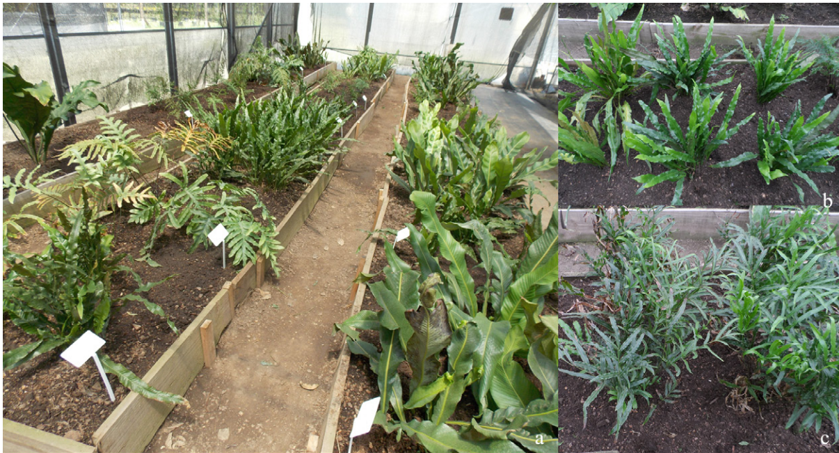
Figure 1. Production of native ferns: a: general view of beds; b. Campyloneurum nitidum ; c. Pteris denticulata .