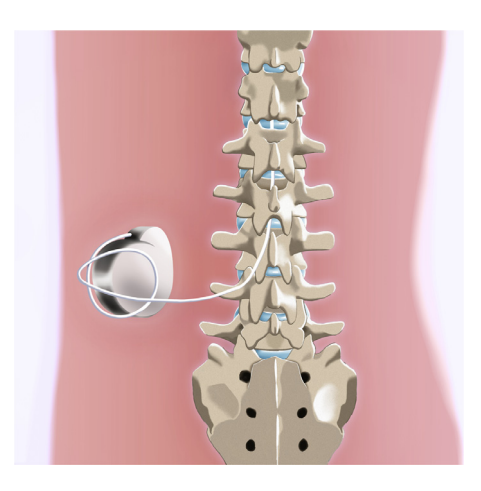
Figure 1 – Scheme of intrathecal infusion pump and spinal catheter.

with chronic pain: lower limb ulcers, avascular necrosis, bone infarctions, chronic osteomyelitis, osteoporosis and chronic arthropathy. The acute pain crisis begins with occlusion of microvascularization by sickle cells, leading to ischemia and hypoxia, triggering tissue and vascular damage. The event causes the release of inflammatory mediators such as substance P, endothelin-1 and prostaglandin E2 (PGE2) with consequent activation of nociceptors. In addition, there is activation of N-methyl-D-aspartate (NMDA) and alpha-amino-3-hydroxy-methyl-5-4-isoxazolpropionic (AMPA) receptors, which contribute to the development of central sensitization.