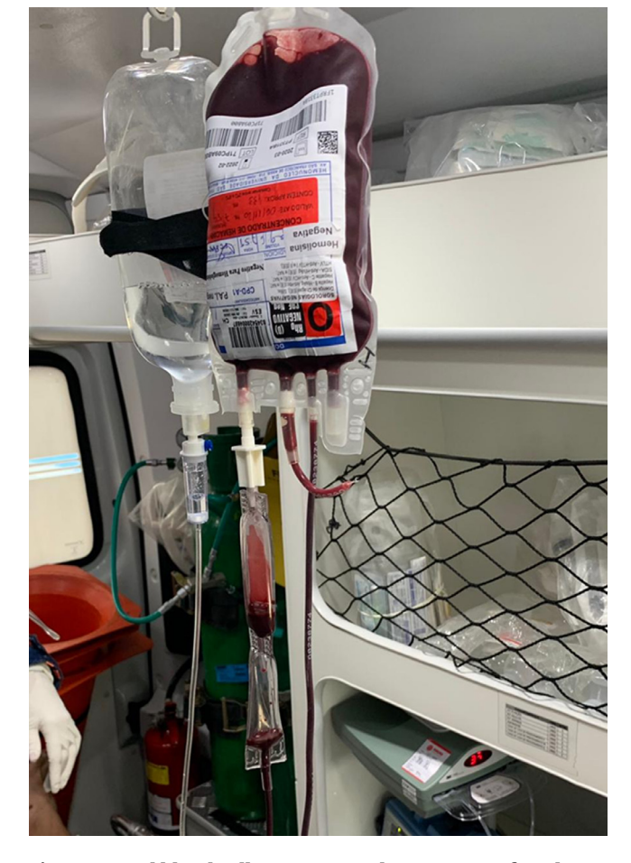
Figure 1 – Red blood cell concentrate that was transfused to the patient.

The patient was transported by ground to the São Francisco University Hospital (HUSF), a tertiary referral hospital in Bragança Paulista, in approximately 20 minutes. Upon arrival at the trauma center, the patient's blood pressure was 100 \times 60 mmHg and heart rate of 120 bpm, demonstrating a good macro hemodynamic response after fluid and blood resuscitation. Thoracostomy was performed at the ER and the chest tube drainage did not characterize a massive hemothorax, so there was no need for a thoracotomy. An exploratory laparotomy was performed to examine the source of the abdominal bleeding and a splenic rupture was found. The surgical team proceeded to a splenectomy (Figure 2).