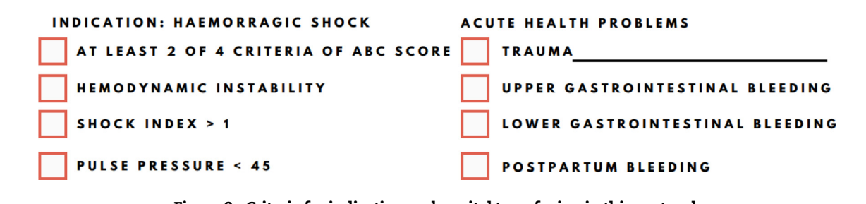
Figure 3 - Criteria for indicating prehospital transfusion in this protocol.