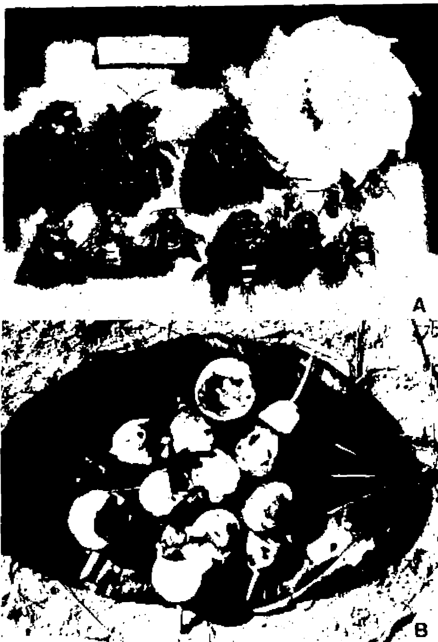
Fig. 3. A - Bees captured on Bellucia grossularioides near Manaus (Brazil); B- Bellucia grossularioides fruits placed on a leaf; average fruit is 2.5 cm long.

On the average, a Bellucia dichotoma tree with seventy to twenty-three open flowers was visited by eight legitimate pollinators per hour during the period (8-10 A.M.) of most intensive bee activity ( n = 8 hrs on four consecutive days in December 1980). These pollinators normally visited all fresh flowers on a tree before flying on, often to another