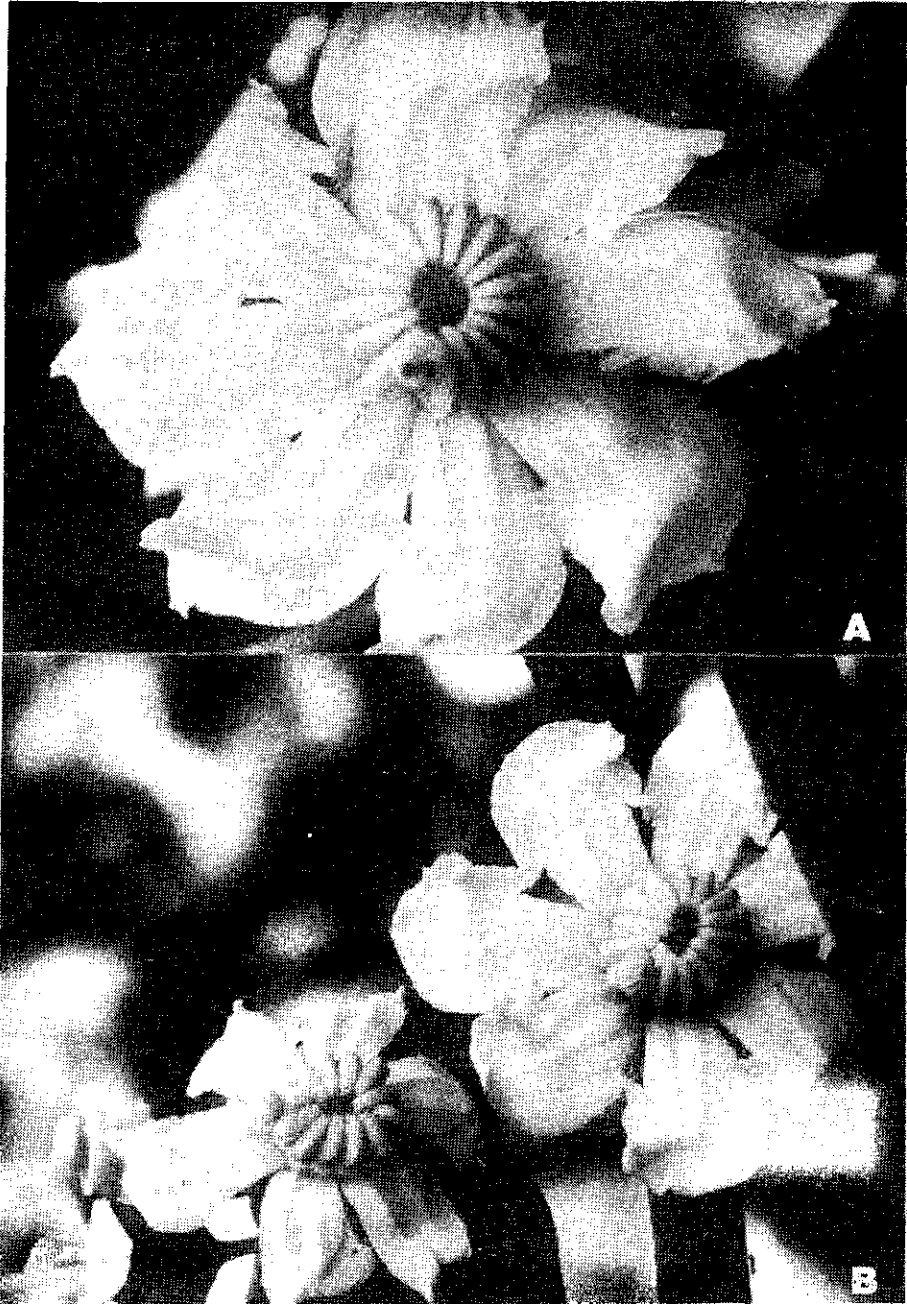
Fig. 2. A - Bellucia grossularioides , petals 22 mm long; B - Bellucia dichotoma to the left, petals 20 mm long, held next to a putative hybrid between B. grossularioides and B. dichotoma .

some scent is produced by this species also. It is noteworthy that odor intensity is strongest in second day flowers which have changed color from white to brown. No nectar is produced by Bellucia flowers.