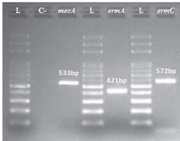
Figure 2 - Electrophoresis gel signifying amplified mecA (533 bp), ermA (421 bp) and ermC (572 bp) genes from the same strain. L: ladder (100 bp). C-: negative control ( S.aureus ATCC 29213).