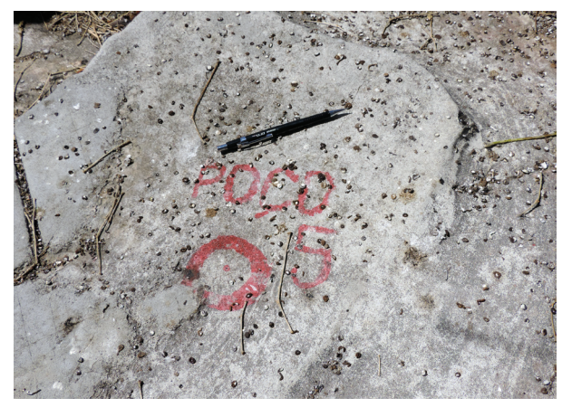
Figure 3 - One of the marks made with permanent paint to indicate a possible drill hole on one of the most important stromatolite geosites in Brazil. This denouncement by the scientific community indicating the imminent damage prevented the realization of the holes (Photo: Kátia Mansur, 2013).

been systematically damaged through sampling, like the example of Fazenda Arrecife, located in the state of Bahia (Figure 3). In this example the warning about future surveys, identified by red paint marks at six possible drilling sites on the best and most didactic exposition of the outcrop, prevented the removal of core samples from one of the most important scientific, aesthetic and educational neoproterozoic stromatolite geosites in Brazil.