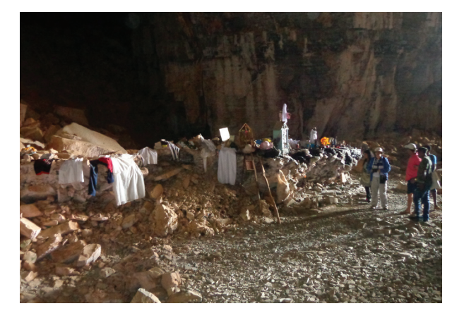
Figure 2 - Photo of religious offerings, remains of molten candle and soot in "Lapa dos Brejões" Cave, Chapada Diamantina, Bahia, Brazil.

Researchers have also been identified as responsible for damage to outcrops, which have