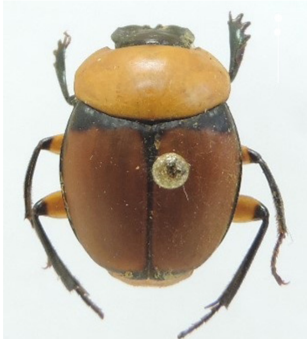
Figures 2 - Scybalocanthon nigriceps sampled in Moreno Fortes Biological Reserve. Scale bar = 2 mm.

This species is grouped as Least Concern in the International Union for Conservation of Nature Red List of Threatened Species (Vaz-de-Mello et al. 2014). Due to its widespread distribution, the main threat presumed for this species is the huge fragmentation and transformation of the Atlantic Forest to anthropogenic land uses (Ribeiro et al. 2009), which can impact the population size and,