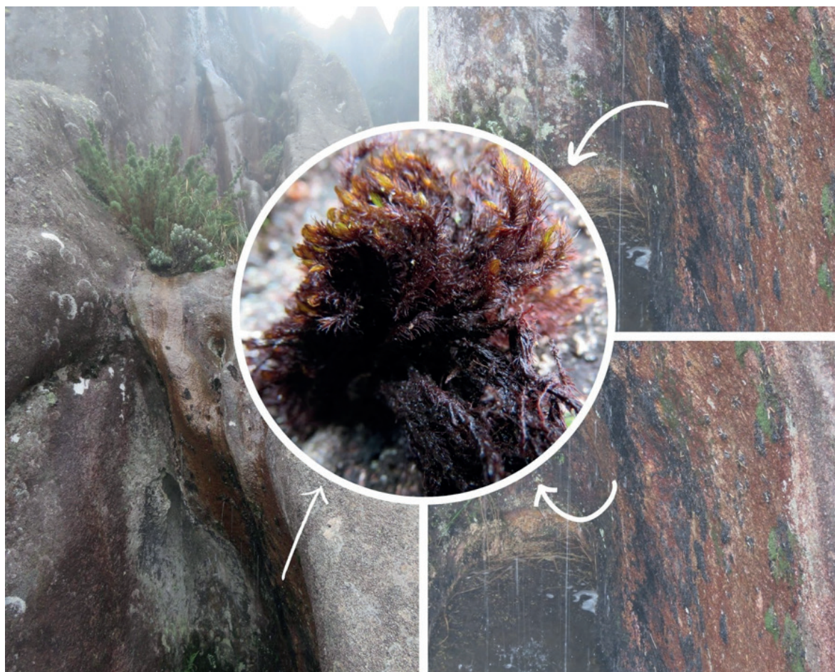
Figure 2. Rock fissures on the Agulhas Negras peak, where A. subulata was collected.

Concerning the conservation status, A. subulata was previously considered Vulnerable (VU) by Costa et al. (2005) in Rio de Janeiro State, but its conservation status in Brazil was not evaluated. In light of the extremely restricted distribution in the country, with only two recent samples (collected in October 31, 2020) from the same population in localities where they went unnoticed in the frequent surveys conducted during the last years, and the decline of habitat quality observed in those localities, we indicate that the conservation status of A. subulata in Brazil is Critically Endangered (CR). This classification is suggested on the ground of the small area of occupancy of the species (less than 10,000 km 2 ), its occurrence in areas intensely visited by tourists, and the fact that it is only known from two localities (Serra dos Órgãos and Serra da Mantiqueira mountains) in high-altitude fields (fragile ecosystems threatened by climate change).