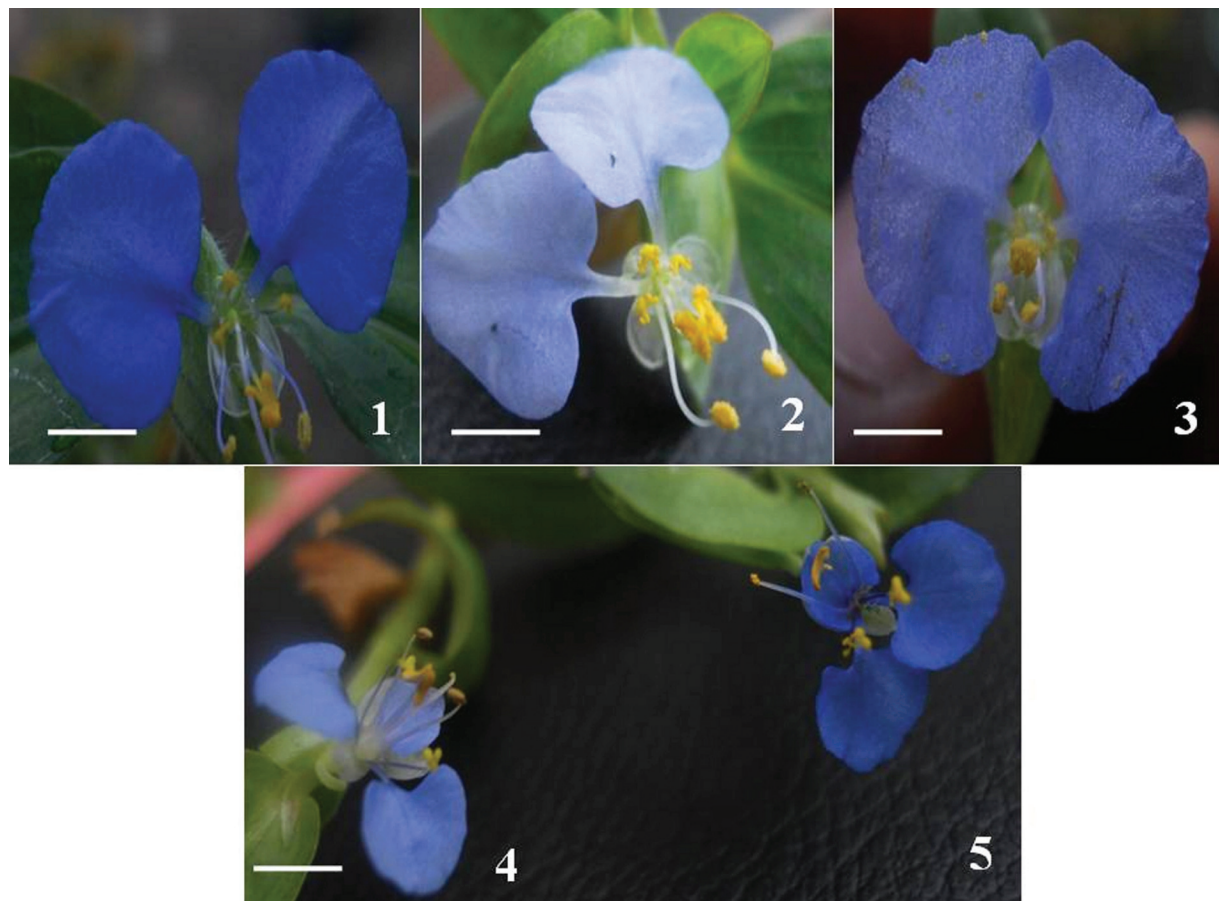
Figures 1-5. Floral morphology of the studied Commelina species and variants. 1. C. erecta Linn. e 1 . 2. C. erecta Linn. e 2 . 3. C. lagosensis C.B.Cl. 4. C. diffusa subsp. montana Morton 5. C. diffusa subsp. aquatica Morton. Bars = 6 mm.

The percent pollen stainability of the three anther types of each species is shown in Tab. 2. Percent pollen stainability was very low in all of the stamen types of Commelina diffusa subsp. aquatica (6.10-17.40%). In all of the species studied, percent pollen stainability was significantly lower for