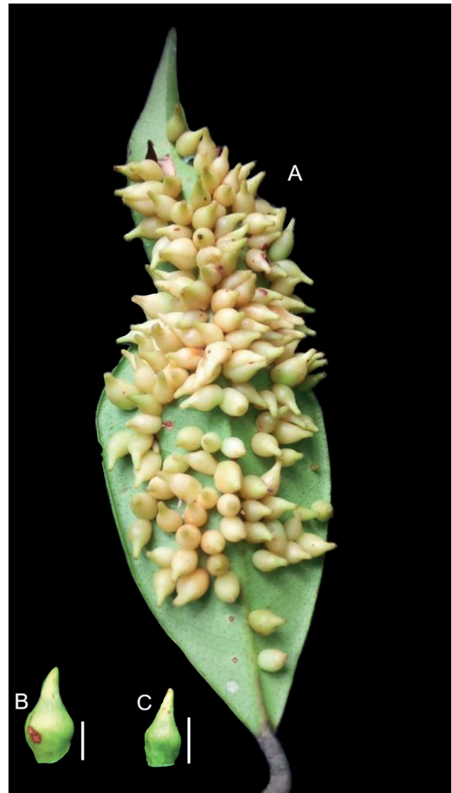
Figure 2. Detail of the leaf of Myrcia neoobscura E. Lucas & C. E. Wilson (Myrtaceae), showing of Cecidomyiidae galls induced on abaxial surface. A. leaf. B. Gall sampled during rainy ( B ) and dry ( C ) seasons. Scale bar = 2mm.

the time of oviposition (Oliveira & Isaias 2009), and sex of the gall inducer (Gonçalves et al. 2009). In this study, we demonstrated the effect of climate on gall morphology, where Cecidomyiidae leaf galls induced on M. neoobscura individuals growing in Cerrado environments responded to seasonality, with up to a 50% increase in weight, volume, and surface area during the rainy season. These increments were also positively associated with precipitation. Dry and hot environments with high temperatures, such as those in the Cerrado, promote special adaptations in insects, including galling (Fernandes et al. 1995; Gonçalves-Alvim & Fernandes 2001). The combination of low humidity and high temperature acts with potential hydrothermal stress in the dry season and is probably one of the physiological factors affecting host plant vigor, and consequently, the