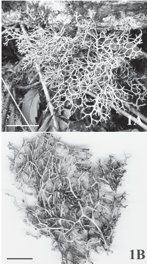
Figure 1. Everniastrum cirrhatum (Fr.) Sipman (A. Gerlach et al. 725). A) E. cirrhatum in the field. B) E. cirrhatum in the laboratory. (Scale bar = 1 cm)

1.0-2.6 mm, respectively. Although both of those authors mentioned the presence of numerous apothecia in the material examined, those structures were not observed in the specimen evaluated in the present study.