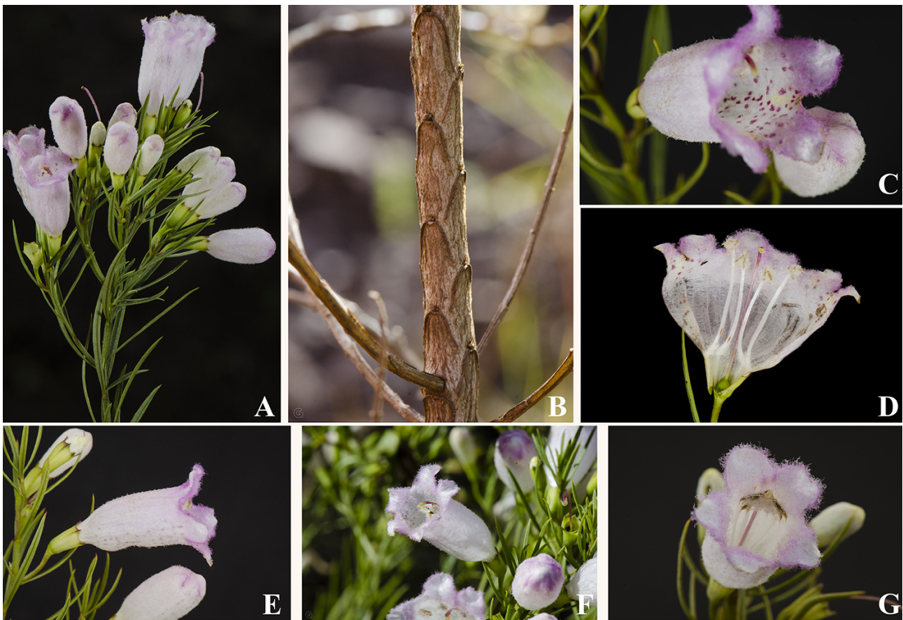
Figure 2. Agalinis marianae V.C.Souza, spec. nov. photographs. A. plant habit B. detail of stem C. spots in the internal part of the corolla D. open corolla showing anthers, reaching the corolla mouth E–G. Details of the flower, calyx tubular, corolla sub–bilabiate, tube cream–white, covered with a villous indument on the outer surface and lobes light–pinkish. in type–locality (paratype).