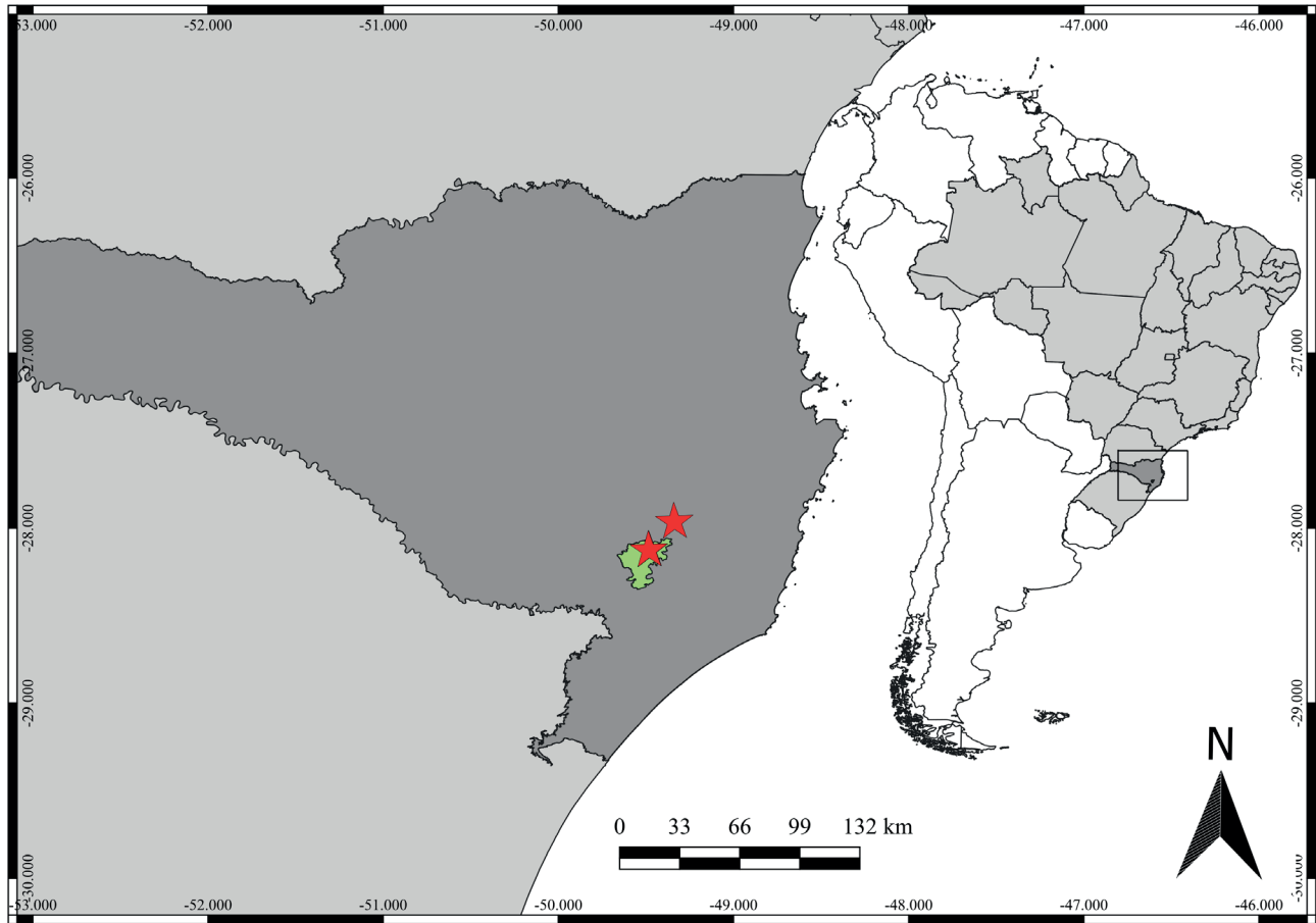
Figure 3. Distribution of Xyris serrana . The light green area represents the São Joaquim National Park. In dark grey, is Santa Catarina State.