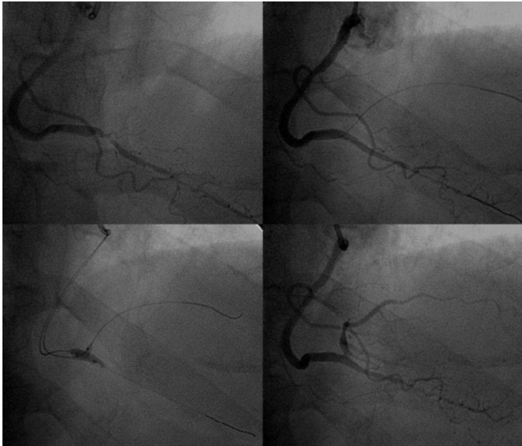
Figure 2 - Successful primary angioplasty.

Although most published studies were not randomized trials but rather case reports, the available evidence suggests that the transulnar approach is feasible, effective, and probably as safe as the transradial approach for coronary interventions. It is an attractive option for institutions that use the radial approach routinely, when performed by experienced operators who are skilled in this technique, particularly in cases of anatomic variations of the radial artery, thin radial pulse, vasospasm, and negative modified Allen test.