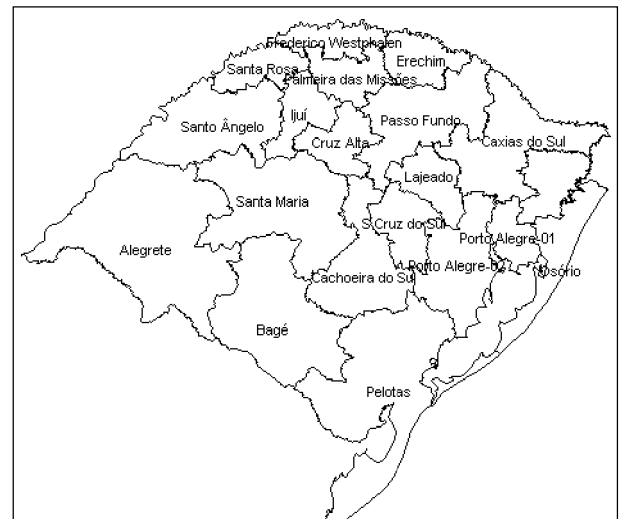
Fig. 1 - Regional Health Coordination Offices of the state of Rio Grande do Sul.

Blood pressure was measured twice during the visit, the last measurement being recorded. Weight measurement was also performed. The sphygmomanometers and scales underwent INMETRO approval; those not approved were not used.