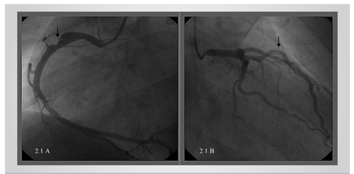
Fig. 2.1.A – Right coronary: Showing ulcerated plaque with thrombus adhered to its surface); 2.1.B – Left anterior descending: showing spontaneous dissection in middle third) (Arrows)