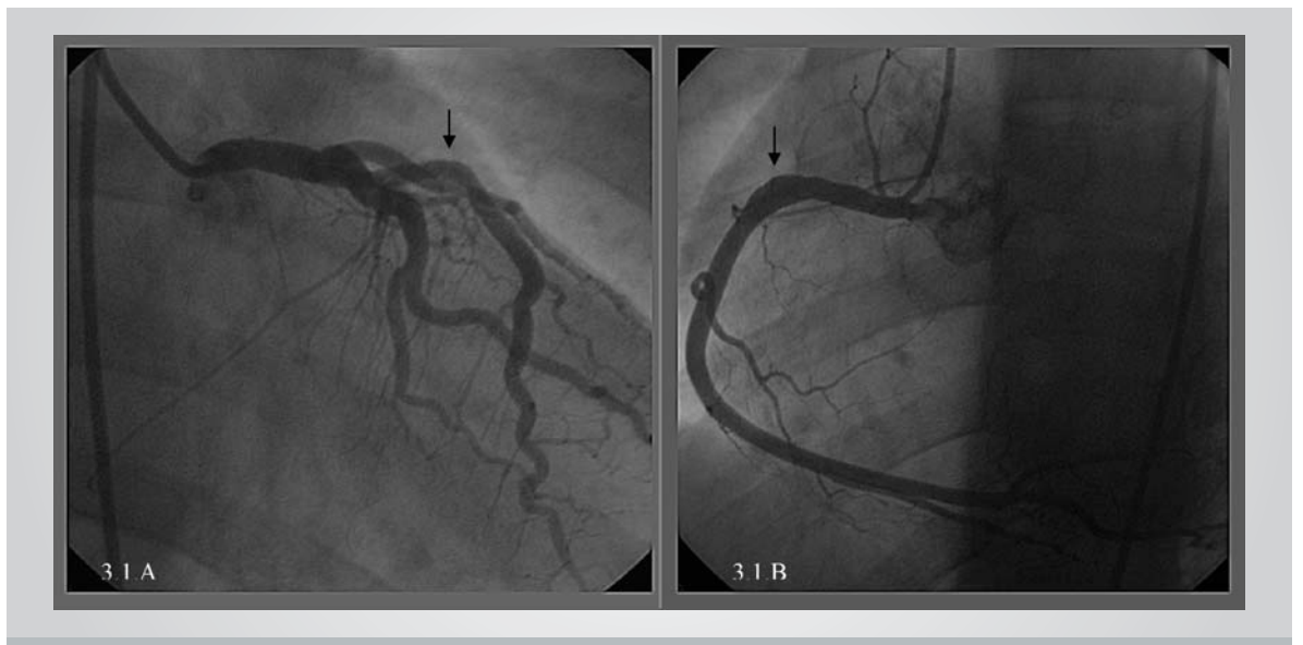
Fig. 3.1.A – Left anterior descending. Angio after stent implant); 3.1.B - Right coronary control coronariography: showing dissolution of intracoronary thrombus (Arrows)