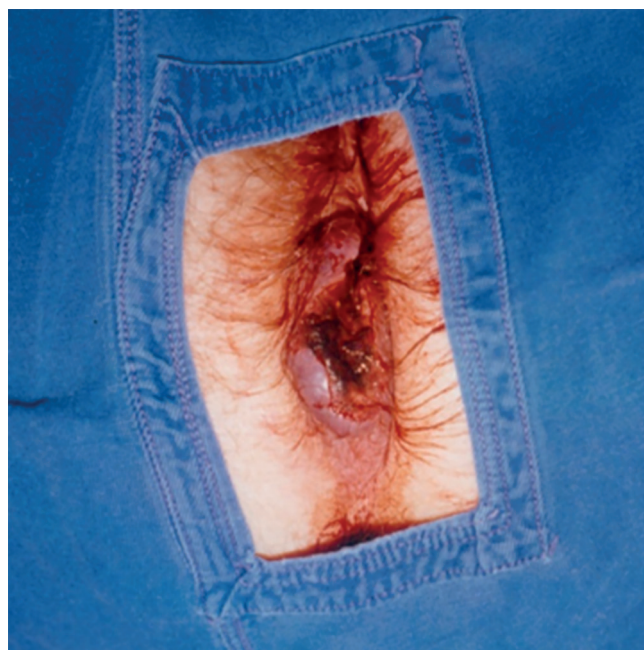
FIGURE 1 - Circunferencial anal lesion in all anorectal canal

Paulo, Brazil, for surgical treatment of the colon lesion and clinical treatment of the anal canal lesion (Figure 1), as he refused to operate the anal lesion. Abdominal ultrasonography and thorax tomography did not reveal any findings. Surgery was then performed with right ileocecal colectomy, intra-operative biopsy of lesion in the anal canal and of the right inguinal lymph node.