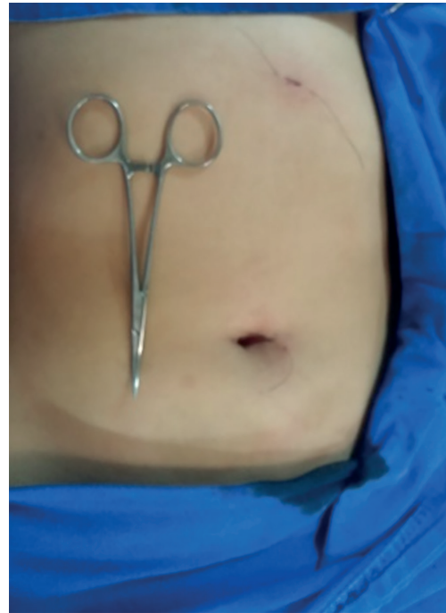
FIGURE 3 - Aesthetic result, superior to conventional videocholecystectomy

the abdominal wall proved vastly superior to conventional videocholecystectomy (Figure 3).