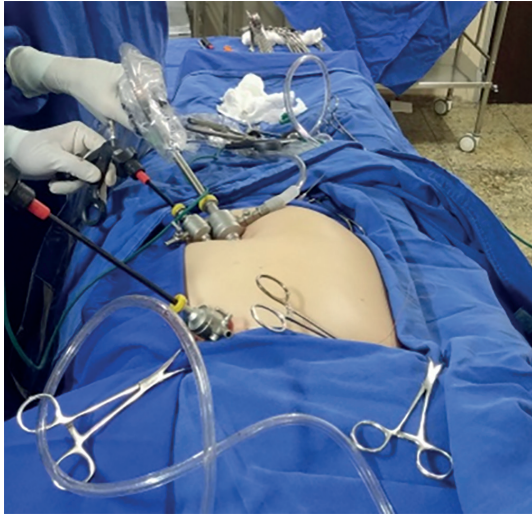
FIGURE 4 – Setup with two trocars in the umbilicus, allowing the surgeon's left hand to hold the gallbladder wall