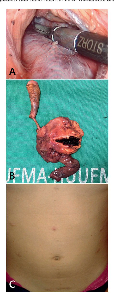
FIGURE 2 – A) Laparoscopic pancreatoduodenectomy; B) specimen; C) final aspect of the abdomen

Surgical resection was performed in all patients, without neoadjuvant chemotherapy. Pancreatoduodenectomy was the procedure of choice in all patients (100.0%), and three different approaches (classic Whipple, pylorus-preserving, and stomach-preserving) were used. Three patients (18.7%) underwent pancreatoduodenectomy with laparoscopy (Figure 2). No liver metastasis was observed. The mean of hospital stay was 10.3 days (5-18). Postoperative complications (2 IIIa and 1 IIIb - Clavien-Dindo) were observed in six (37.5%; grade A or B pancreatic fistula in three patients; infection, bleeding, and pancreatitis in one patient each). Patient 3 had a grade B pancreatic fistula that was treated with percutaneous drainage guided by computed tomography; patient 4 had an infection that was drained percutaneously with ultrasonography; patient 8 had hypovolemia as a result of abdominal bleeding and underwent surgical intervention; patient 10 had acute pancreatitis that resolved after clinical treatment. No hospital mortality was observed. All patients were followed by a clinical oncologist, and no adjuvant chemotherapy was administered. One was lost to follow-up (case 1) after one year without recurrence. Median follow-up was 3.6 years (nine months to five years), and no patient had local recurrence or metastatic disease.