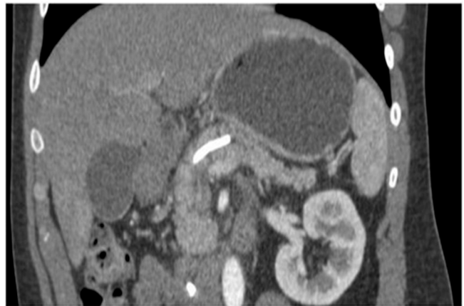
FIGURE 4 – Abdominal CT showed complete resolution of the pancreatic fluid collection

On the 30 th post-drainage day, a new abdominal CT showed complete resolution of the pancreatic collection (Figure 4). The patient is currently on two months follow-up and remains asymptomatic. An ERCP is planned on the 3 rd month evaluation for removal of the pancreatic stent.