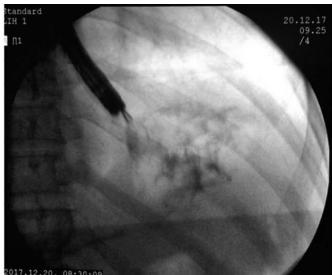
FIGURE 3 – Hot-AXIOS™ removed using a foreign body forceps

On the 14 th post-drainage day, we performed another upper endoscopy and an ERCP for assessment of the main pancreatic duct. Firstly, we tried to introduce a typical gastroscop through the stent but it was not possible due to the complete collapse of the prosthesis. Then, we instilled contrast through the stent and we notice complete reflux back to the gastric chamber, confirming the complete collapse of the collection. Pancreatography revealed a stricture in the transition of the head and neck but no fistula. We performed a pancreatic sphincterotomy and placed a 7F x 10 cm straight plastic stent through the stricture. After deployment of the pancreatic stent, we removed the Hot-AXIOS using a foreign body forceps (Figure 3). The patient was asymptomatic and was discharged 24 h after the ERCP procedure.