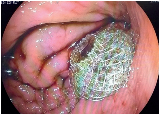
FIGURE 2 – Endoscopic drainage with a 10x10 mm HOT-AXIOS™ stent with an immediate output of a brownish secretion with necrotic solid components

anesthesia. After puncture, there was an immediate output of a brownish secretion with necrotic solid components (Figure 2). The total duration of the procedure was 20 min and the time required for drainage was 4 min. We did not use fluoroscopy and there were no immediate complications.