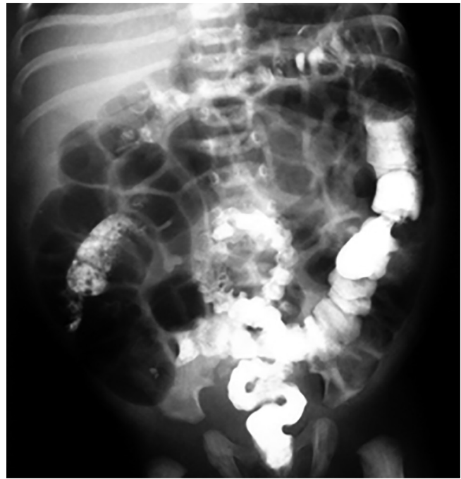
FIGURE 2 - Abdominal distention and irregular contraction

Rectosigmoid index is obtained by dividing the widest diameter of the rectum by the widest diameter of the sigmoid loop when the colon is fully distended by the contrast medium 5,16 . The normal rectosigmoid index is \geq 1 . In standard length HD the rectosigmoid index is \leq 1 .