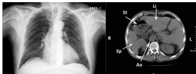
Li=liver; St=stomach; Sp=spleen; Ao=aorta

biopsy revealed moderately differentiated adenocarcinoma. His carcinoembryonic antigen was 1,8 ng/dL. ECG and chest radiography indicated dextrocardia. Computerized tomography showed complete transposition of abdominal viscera, confirming situs inversus totalis (Figure 1).