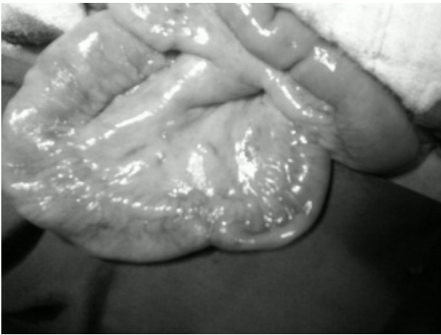
FIGURE 2 - Ileum stenosis 20 cm from ileocecal valve represented by lymphocytes, plasma cells, neutrophils, vascular congestion and interstitial edema, revealed necrotizing inflammatory process (Figure 3).