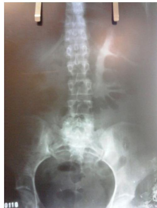
FIGURE 1 - Radiological abdominal aspect with edema of small bowel loop

Woman of 39 years, was admitted to the emergency department with a history of prior pelvic radiotherapy for tumor of the uterus about six years with loss of 15 kg in a month, cramping and abdominal pain. She reported that after drinking liquids and / or