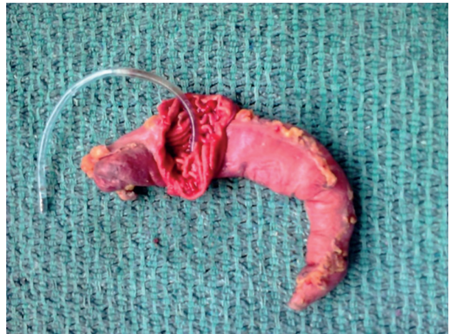
FIGURE 1 - Resected sleeve specimen showing the nasogastric tube embedded in the stapler line

pulled out under vision. The gastric calibration tube was kept in situ and the rent on the sleeve was sutured using 2-0 polyglycolic sutures in two layers. Leak test was re-done and ports were closed after inserting an abdominal drain. She had some postoperative reflux which settled with conservative treatment and check endoscopy after six weeks showed no evidence of stricture or ulceration at the site of suturing.