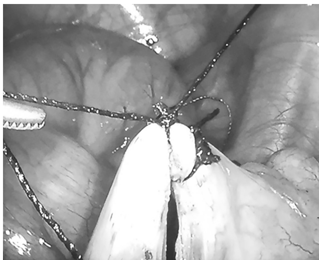
FIGURE 3 - Double ligation of the appendicular base

In some cases, with appendix in retrocecal position, the right colon was mobilized by careful right parietocolic dissection in sufficient length to completely expose the appendix similar to the dissection for right colectomy. After ligation of the appendicular base, was proceeded dissection and cauterization of mesoappendix vessels with monopolar electrode in its terminal branches, near the appendix. When some large-caliber vessels were present, where electrocoagulation was not appropriated, dissection and ligation with cotton thread 2-0 were performed.