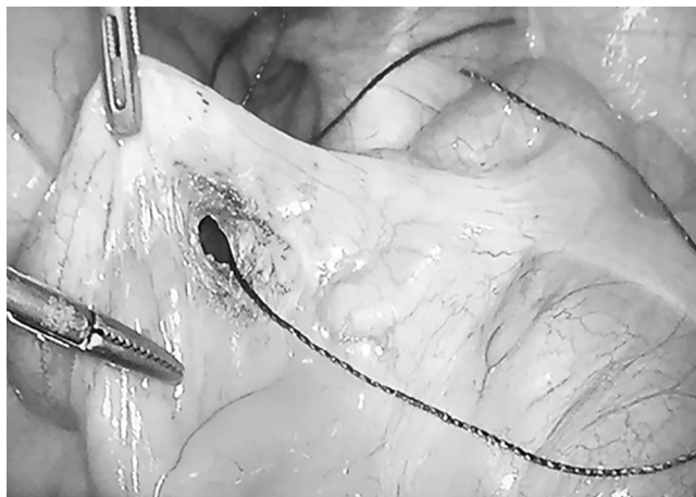
FIGURE 2 - Transfixing orifice near appendix base

The appendix was identified and mobilized to make possible to dissect its mesentery in appendicular base, creating small transfixing orifice in mesoappendix (Figure 2). Through this orifice were passed two cotton stitches 2-0 and performed double endosuture ligation of appendicular base, one proximal and another distal (Figure 3).