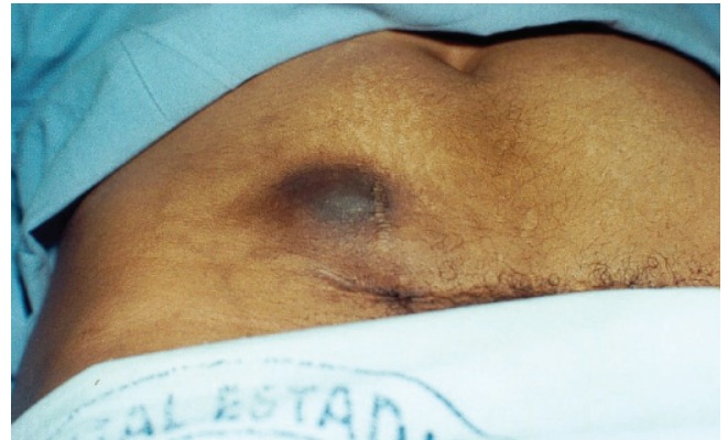
FIGURE 1 – Endometrioma near the scar of cesarean section, with emphasis on color

and six left) and left flank in one. All were located near the surgical scar from cesarean section (Figure 1). In two cases, were in the umbilical region. One tumor showed exophytic, with cerebriform and external bleeding during menstruation. The size of lesions ranged from 1.6 x 6.0 x 1.5 cm and 4.0 cm. All had tenderness, blurred boundaries, soft consistency and increased sensitivity.