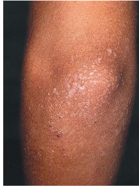
FIGURE 1: Keratotic papules on elbow

After the diagnosis of epidermodysplasia verruciformis, treatment was initiated with salicylic acid, retinoic acid, photoprotection, levamisol and Thuya CH30, with no improvement. Because of the exten-