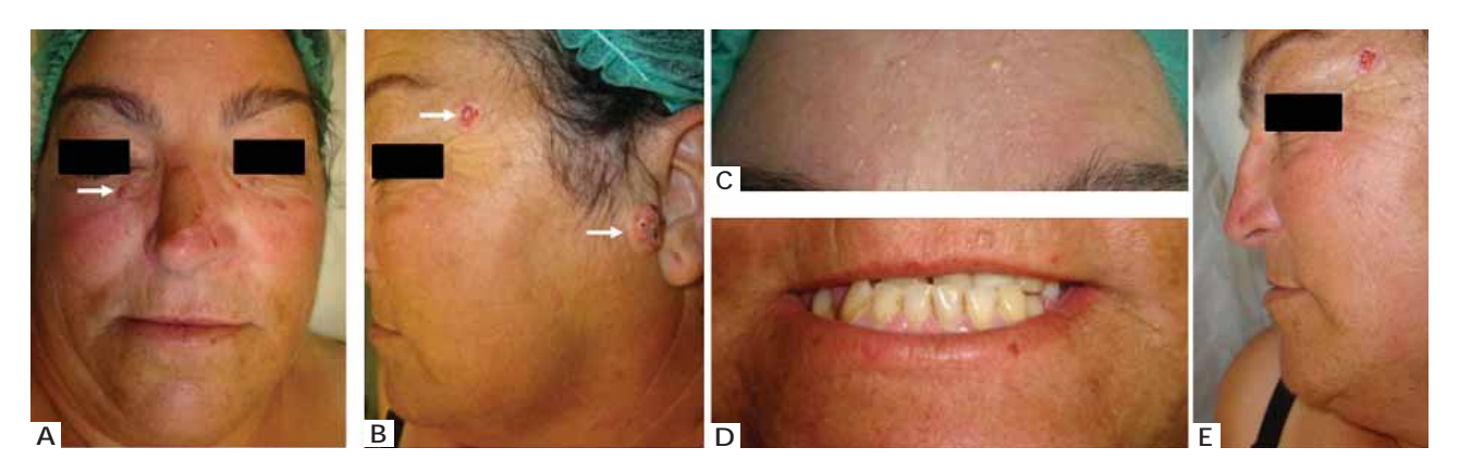
FIGURE 1: Patient's clinical appearance. Three nodular basal cell carcinomas (arrows), multiple milia (c) and coarse facies with hypertelorism and prognathism (d,e)