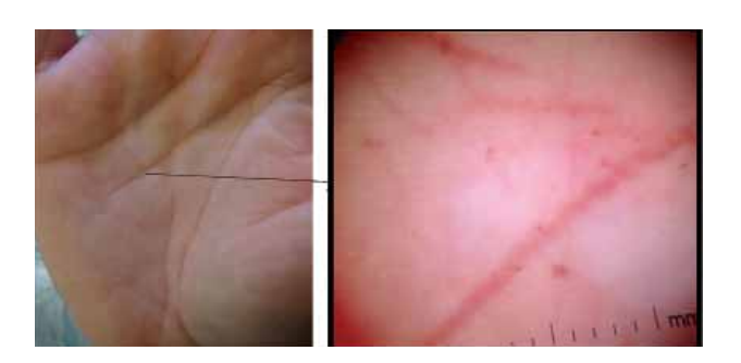
FIGURE 3: Dermoscopic features of palmar pitting. Flesh-colored, irregular-shaped and slightly depressed lesions, some with red globules