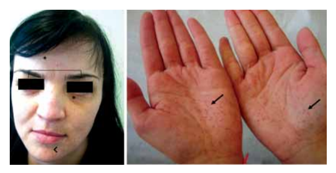
FIGURE 4: Patient's daughter's clinical appearance. Hypertelorism (line), prognathism (head arrow), milia (asterisks) and severe palmar pits (arrows)