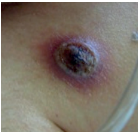
FIGURE 1 : Erythematous circular lesion with a necrotic center under the cardiac monitoring electrode