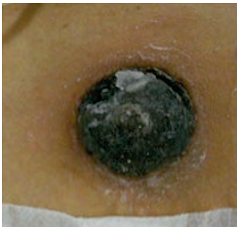
FIGURE 2 : Necrotic circular lesion under the cardiac monitoring electrode