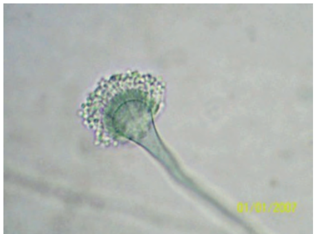
FIGURE 5 : Microculture in lamina confirmed the species Aspergillus niger