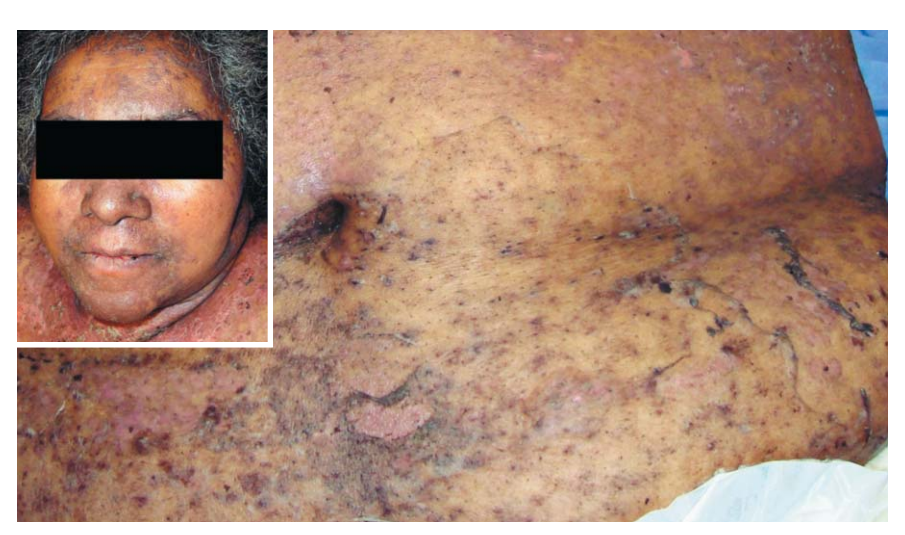
FIGURE 3: Third day of IVIG, with partial reepithelization

Prospective open studies and case series show evidence on IVIG use in SJS/TEN. Among studies that demonstrated no benefits of IVIG, the largest included patients with chronic renal failure and age >60, factors associated with greater basal mortality, and probably, bad response to IVIG. <sup>7</sup> Many patients received 2 g/kg of IVIG, a dose lower than presently recommend-