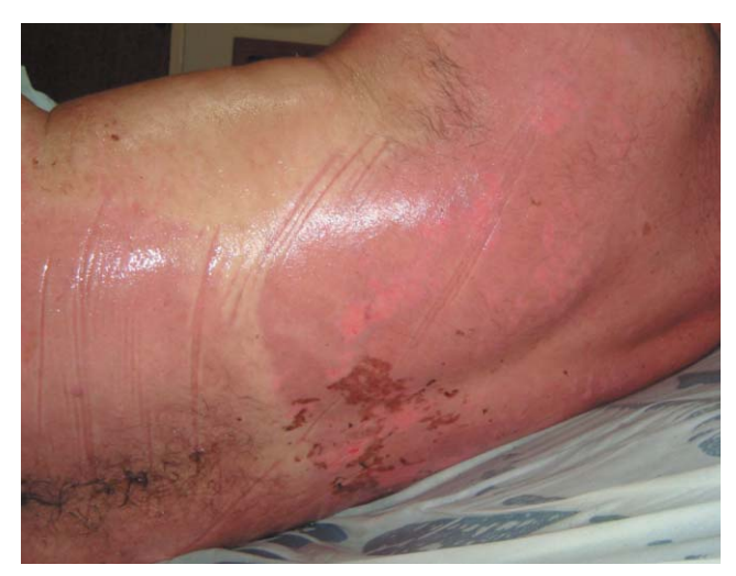
FIGURE 5: Fifth day of IVIG, showing almost complete reepithelization

ed, as also shown in other studies that obtained no benefit.