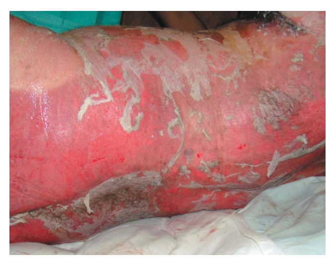
FIGURE 4: Eighth day of evolution, first day of IVIG. Large denuded areas on posterior trunk