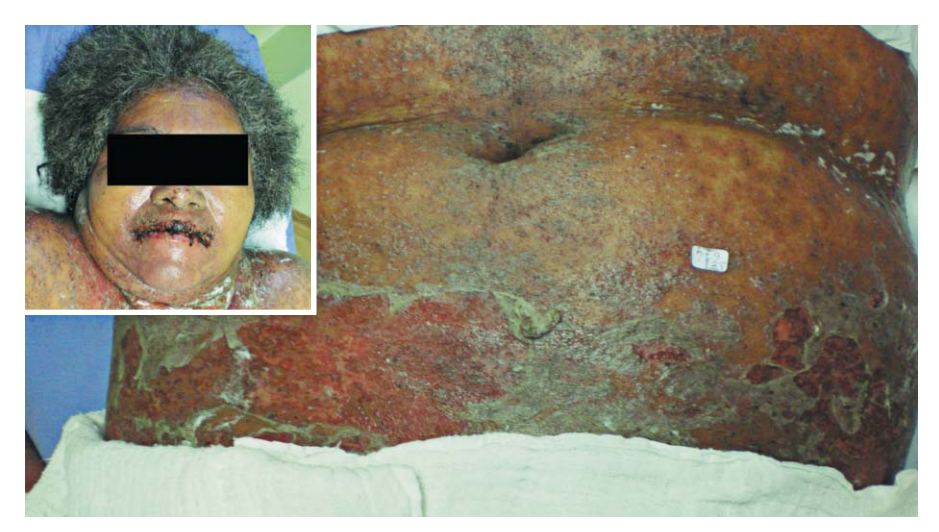
FIGURE 2: Fourth day of the disease. Oral involvement and areas of ulceration on the trunk