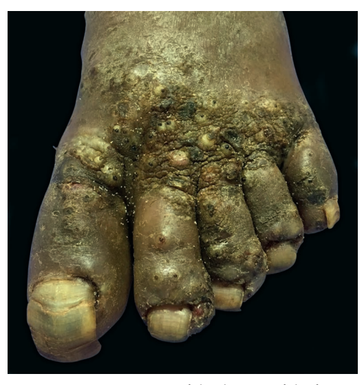
FIGURE 1: Lesions on most of the dorsum of the foot

A 52-year-old male patient, with low socioeconomic status, retired due to disability because of an amputation at the level of the proximal third of the right lower limb due to a car accident six years ago, without comorbidities, reported lesions with intense local pruritus, with one year of evolution, located on the left foot, right lower limb stump and hands (Figure 1). He reported appearance of lesions soon after moving to a place where previously a pigsty was located, in a neighborhood on the periphery of the city of Campo Grande. At examination, papular-nodular-keratotic-crusty lesions were observed, with blackened central elevation, in large numbers, sometimes converging in extensive plaques in the heel and anterior dorsum, being fewer in the medial region of the left foot, dispersed in the fingers and on the right thigh stump. During initial evaluation, a flea transiting between the lesions was observed by dermoscopy. Anatomopathological examination revealed presence of a female of Tunga penetrans below the stratum corneum (Figure 2).